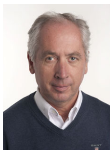
Torbjörn Tomson is professor in neurology and epileptology at Karolinska Institutet, Sweden.

In this issue of Epilepsia , a joint Task Force of the Commission on European Affairs of the International League Against Epilepsy (ILAE-CEA) and the European Academy of Neurology (EAN) provides recommendation for the use of valproate (VPA) in the treatment of epilepsy in women and girls 1 in light of the new warnings issued by the European Medicines Agency (EMA). 2